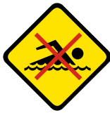
SWIMMING NOT ADVISED