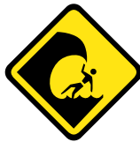
UNEXPECTED LARGE WAVES