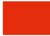
BEACH IS CLOSED